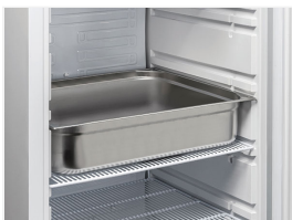
Cabinet suitable for GN2/1 pans