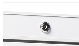
Lock fitted as standard