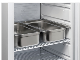
Cabinet suitable for N.2 GN1/1 pans